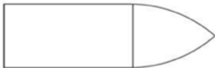
Figure 1. The G1 standard projectile.

To date, the 'standard projectile' used to define BCs for the entire sporting arms industry is the G1 standard projectile. The G1 standard projectile which is shown in Figure 1 has a short nose, flat base, and bears more resemblance to a pistol bullet or an old unjacketed lead black powder cartridge rifle bullet than to a modern long range rifle bullet.